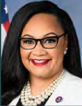
The Hon. Nikema Williams Congress Woman Georgia's 5th District

Congresswoman Nikema Williams has been a fierce advocate for social justice, women and families throughout her political and professional career.