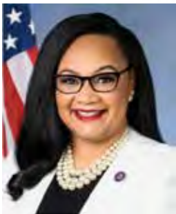
Hon. Nikema N. Williams